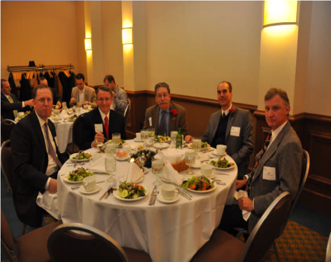
December 2009 Chapter Meeting