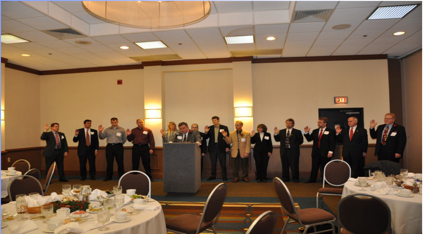
Swearing in of the new GLCAI 2010 Officers.