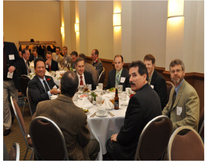
December 2009 Chapter Meeting