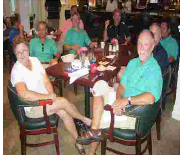
Waiting for the program to begin.