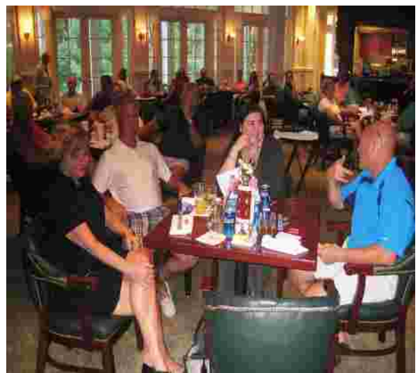
Relaxing and enjoying the dinner after a long day of golf.